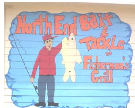
Located down at Roll Over Pass