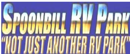
Smith's Point, TX